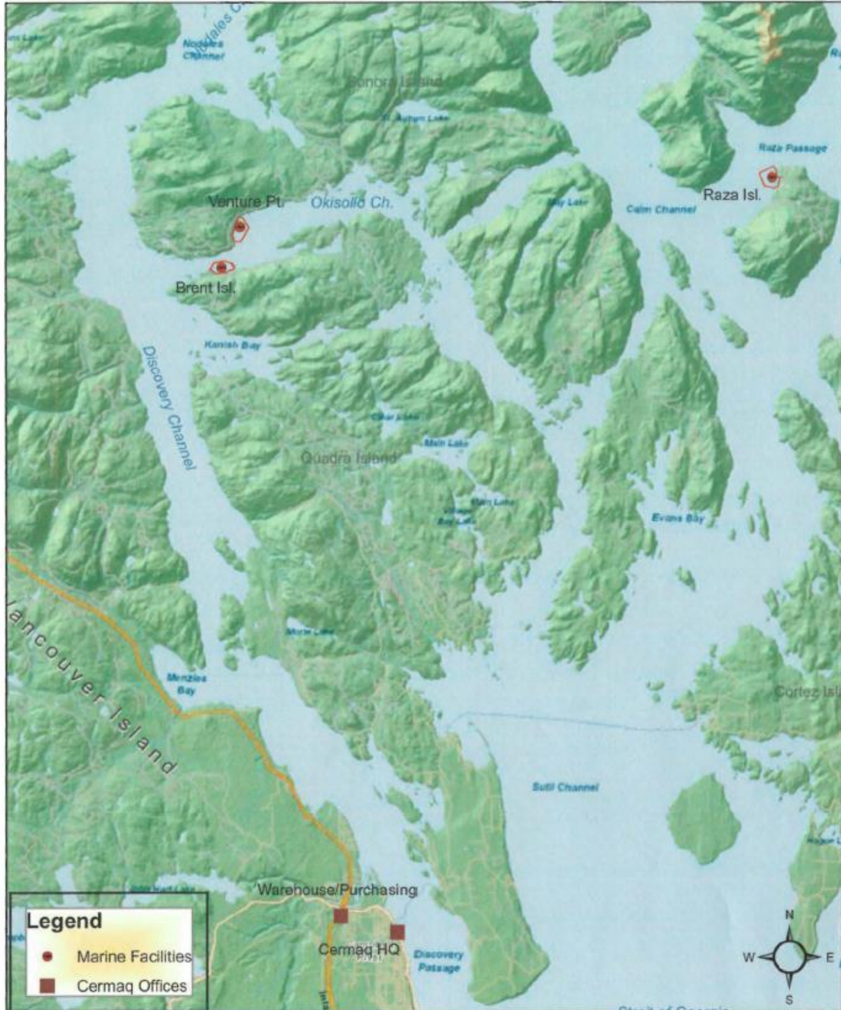
Map 1: General Location Map